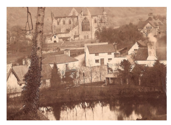
The mill pond beside the Royal George Hotel.